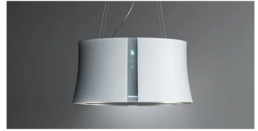
Photograph is for information purposes only. May not correspond to the selected version